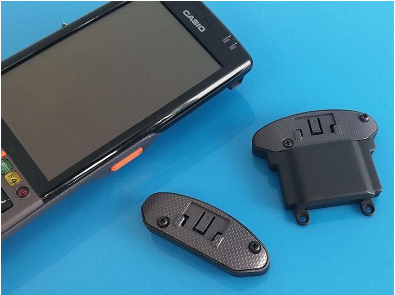
iID module IT-G500 BM (right side)